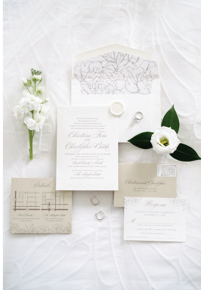
THE POLKA DOT PAPER SHOP designed the couple's timeless ivory and grey stationery.