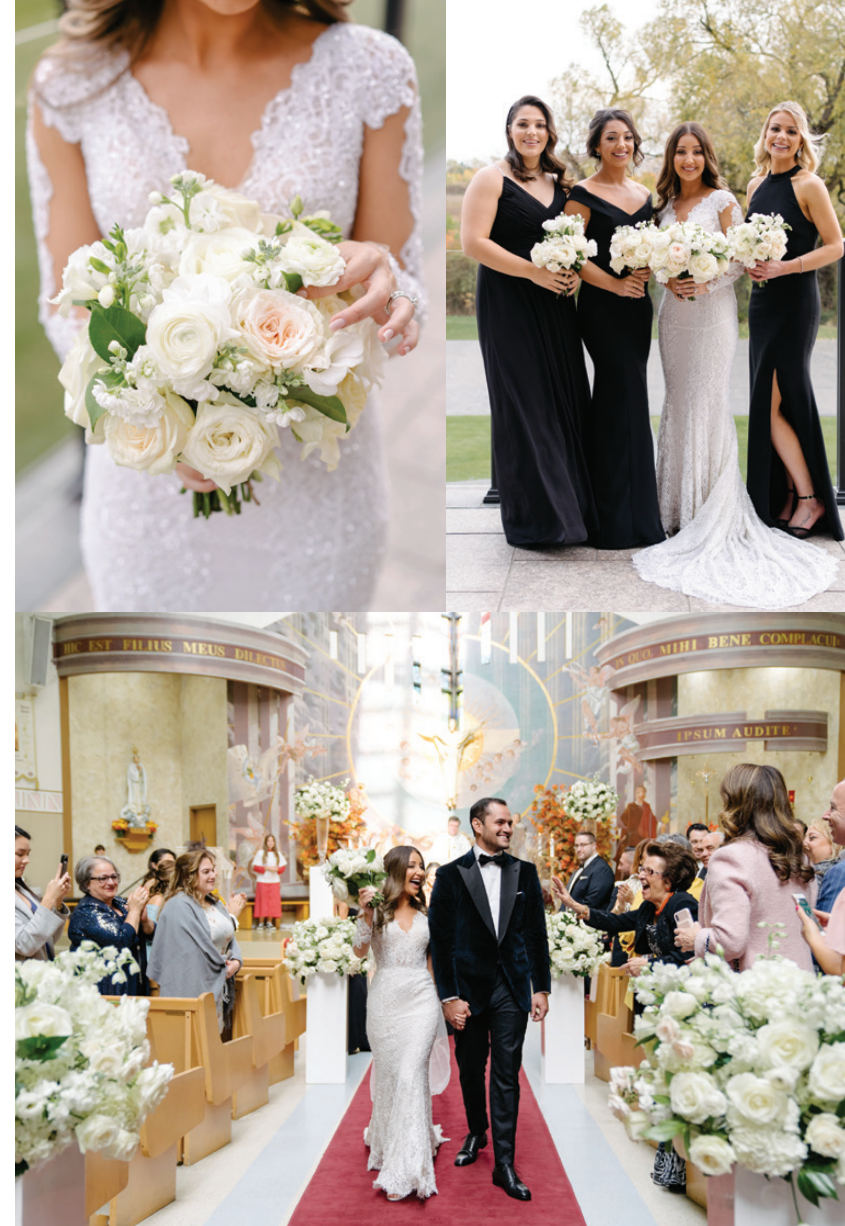
Bridesmaid dresses from ELISABETH & BEAU.