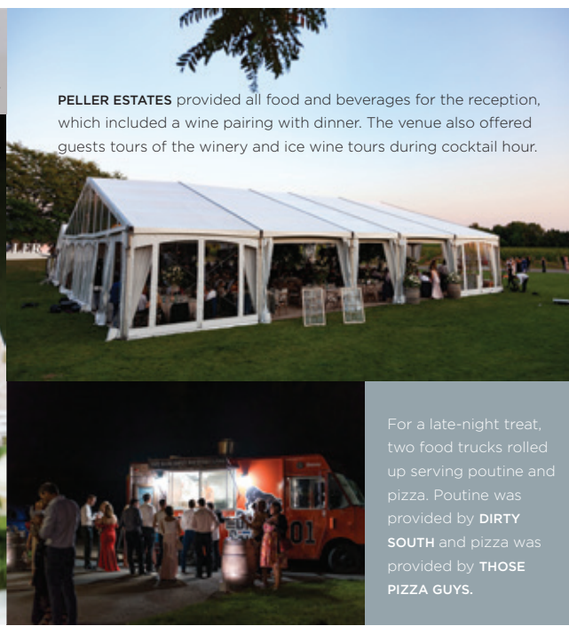
For a late-night treat, two food trucks rolled up serving poutine and pizza. Poutine was provided by DIRTY SOUTH and pizza was provided by THOSE PIZZA GUYS .