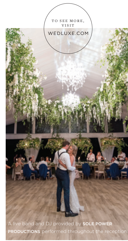
A live band and DJ provided by SOLE POWER PRODUCTIONS performed throughout the reception.