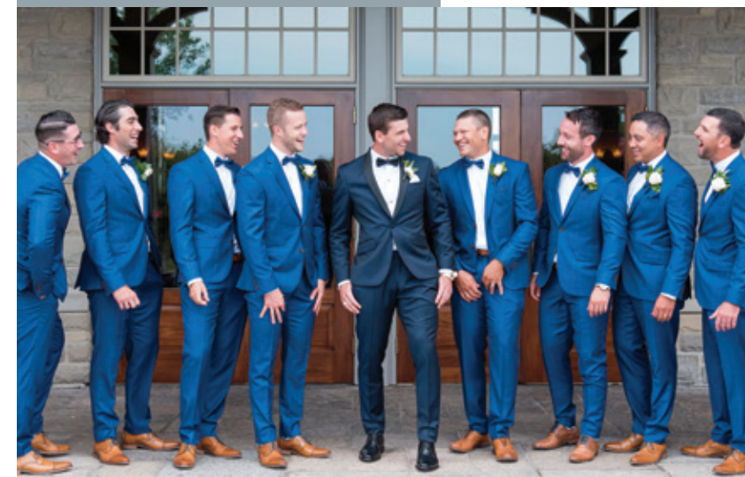
The groomsmen, among which were fellow NHL players Kyle Okposo, Sam Gagner, Ryan Strome, Cody Goloubef, Cal Clutterbuck, and Matt Moulson, wore blue formalwear by Jack Victor, purchased from LONG ISLAND FOR MEN .