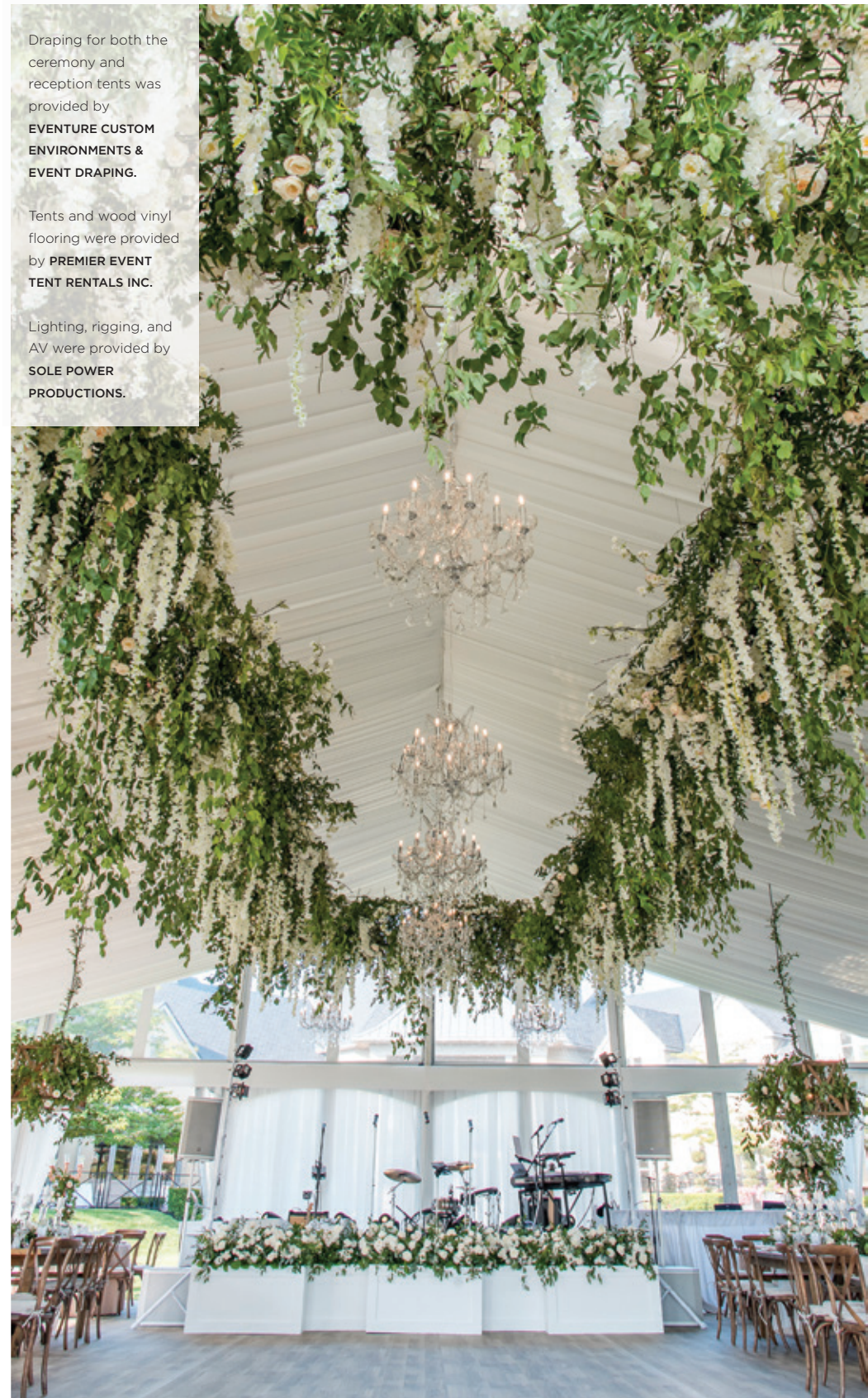
Draping for both the ceremony and reception tents was provided by EVENTURE CUSTOM ENVIRONMENTS & EVENT DRAPING.