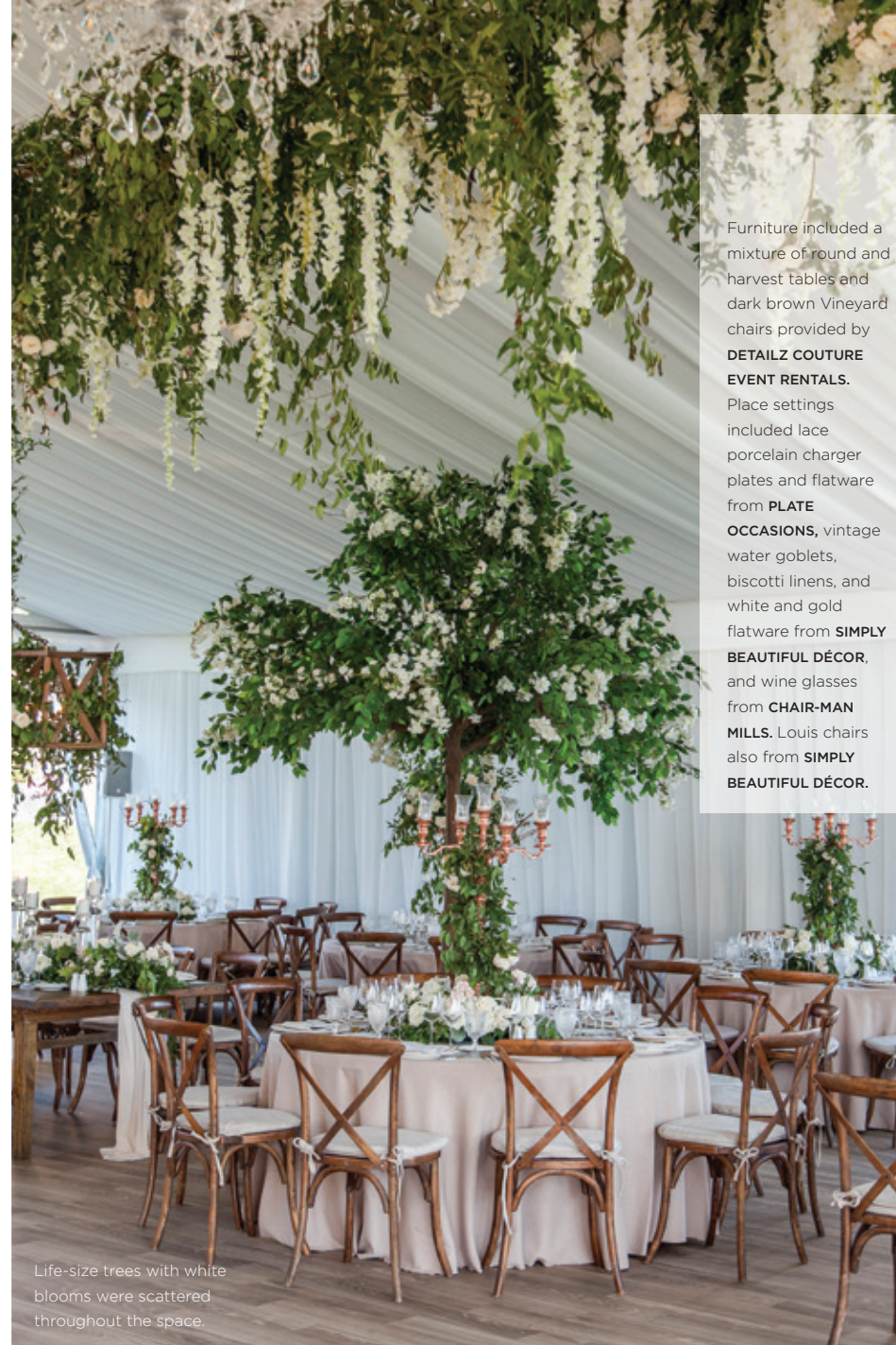
Life-size trees with white blooms were scattered throughout the space.