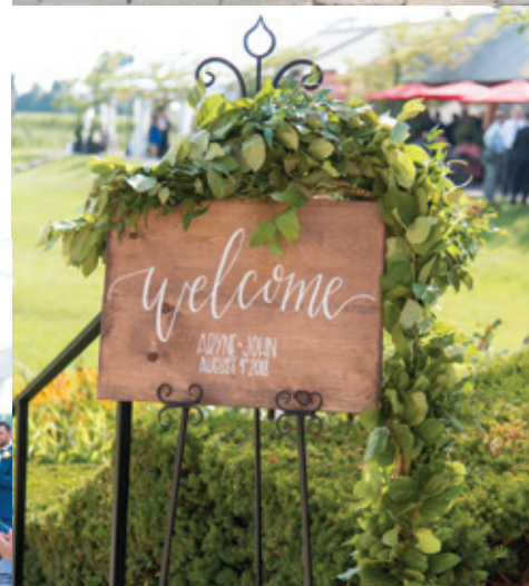
Programs were designed by PAPER & POSTE and the welcome sign was provided by KRIEGER CUSTOMS.