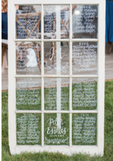
The windowpane seating chart, along with the wooden welcome sign and table numbers, were provided by KRIEGER CUSTOMS .