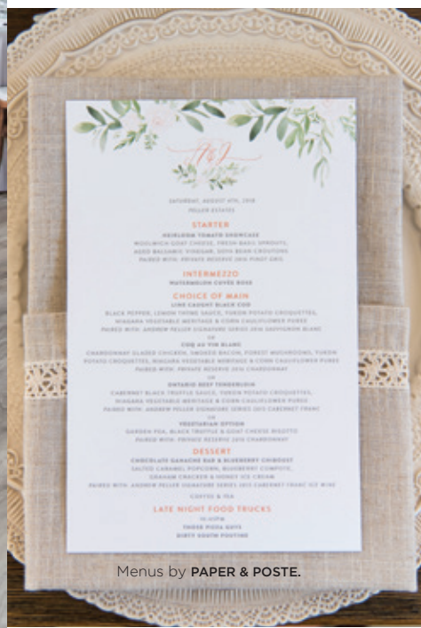
Menus by PAPER & POSTE .