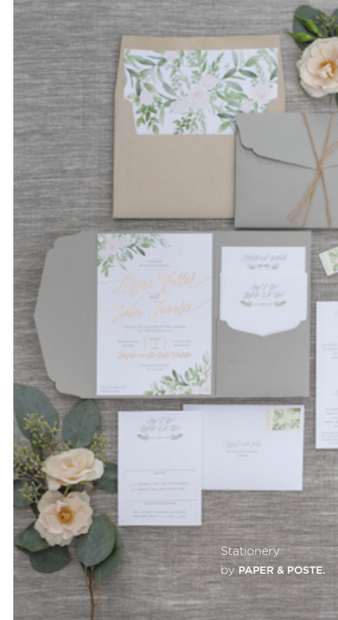
Stationery by PAPER & POSTE .