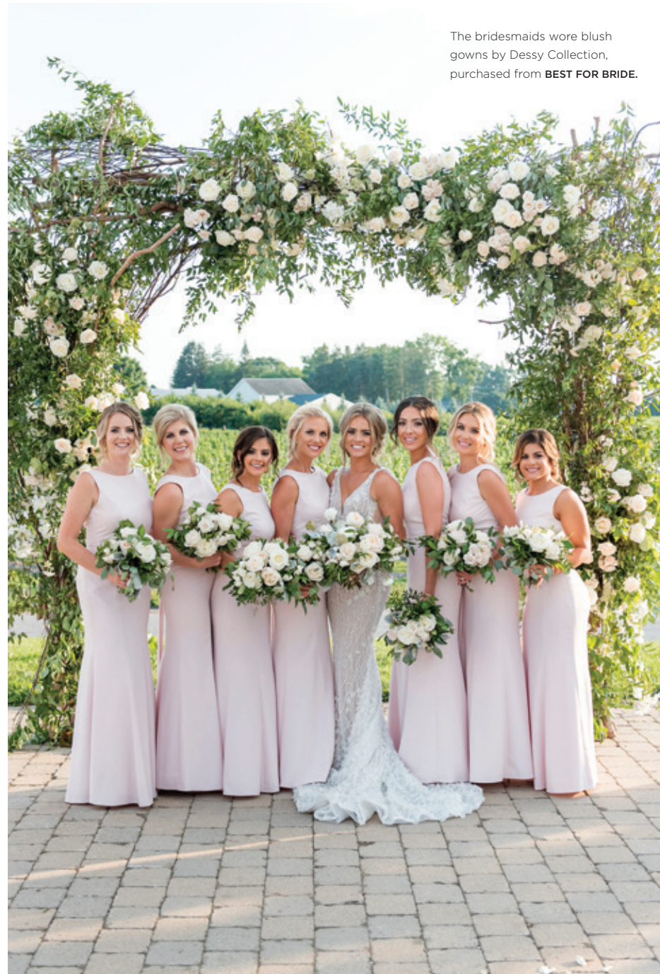
The bridesmaids wore blush gowns by Dessy Collection, purchased from BEST FOR BRIDE.