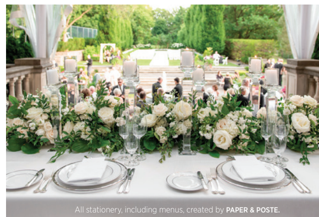
All stationery, including menus, created by PAPER & POSTE .