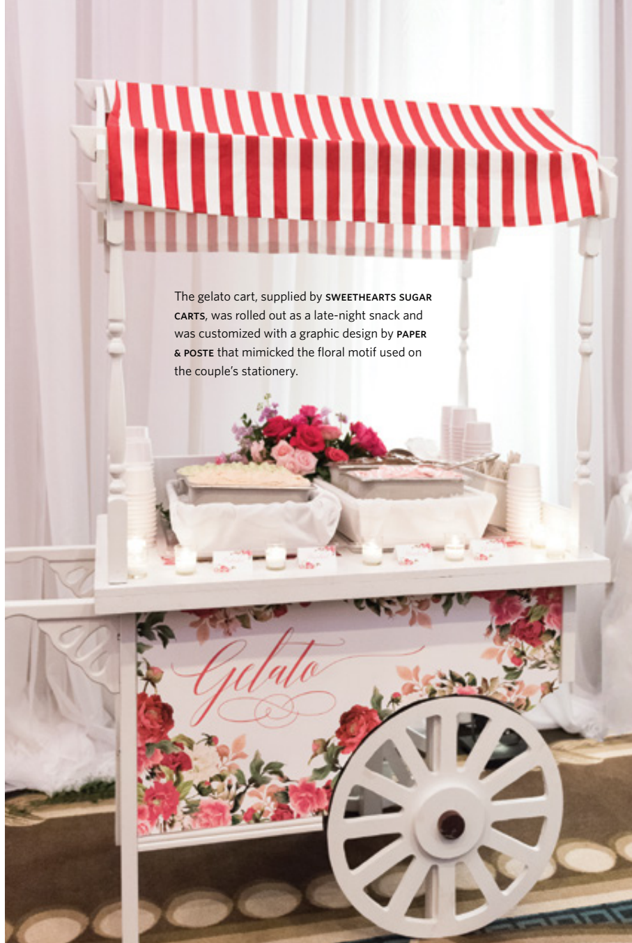
The gelato cart, supplied by SWEETHEARTS SUGAR CARTS, was rolled out as a late-night snack and was customized with a graphic design by PAPER & POSTE that mimicked the floral motif used on the couple's stationery.