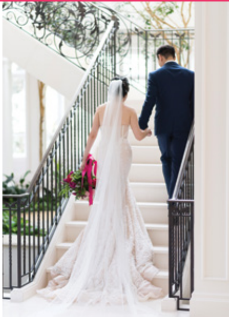
Following the ceremony, guests made their way to the GRANITE CLUB , where both the cocktail hour and wedding reception took place.