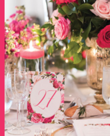
Table numbers and menus were designed by PAPER & POSTE and featured the pink and white floral motif from the couple's invitations.

In addition to the organic foliage that served as an homage to Italian flora, hand-tied mini baguettes with a rosemary sprig were prepared by the Granite Club for every guest. Tableware, flatware, and stemware were provided by the Granite Club .