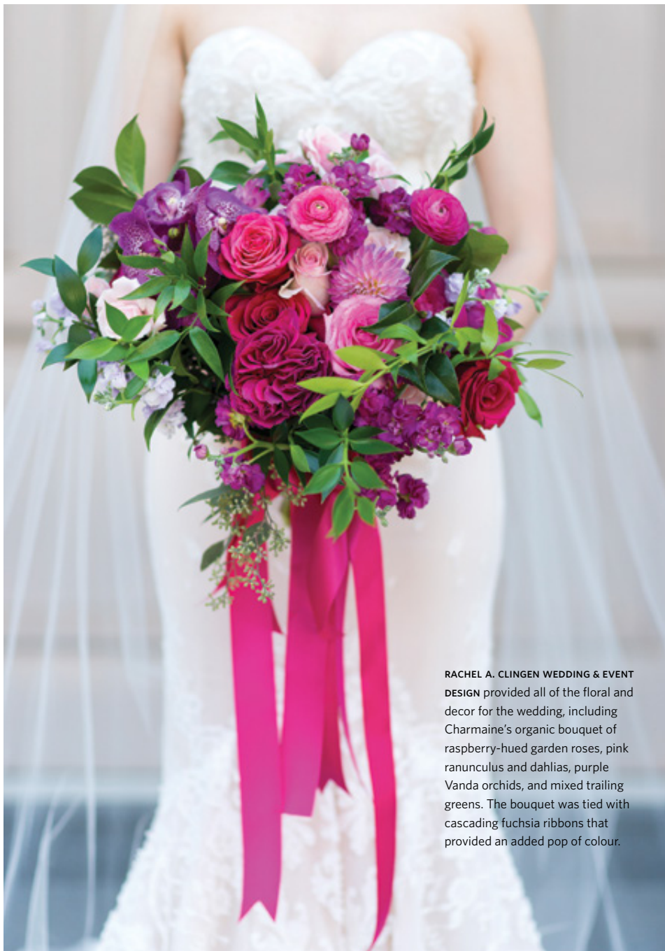
RACHEL A. CLINGEN WEDDING & EVENT DESIGN provided all of the floral and decor for the wedding, including Charmaine's organic bouquet of raspberry-hued garden roses, pink ranunculus and dahlias, purple Vanda orchids, and mixed trailing greens. The bouquet was tied with cascading fuchsia ribbons that provided an added pop of colour.