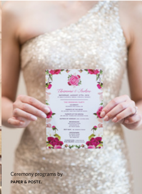
Ceremony programs by PAPER & POSTE .