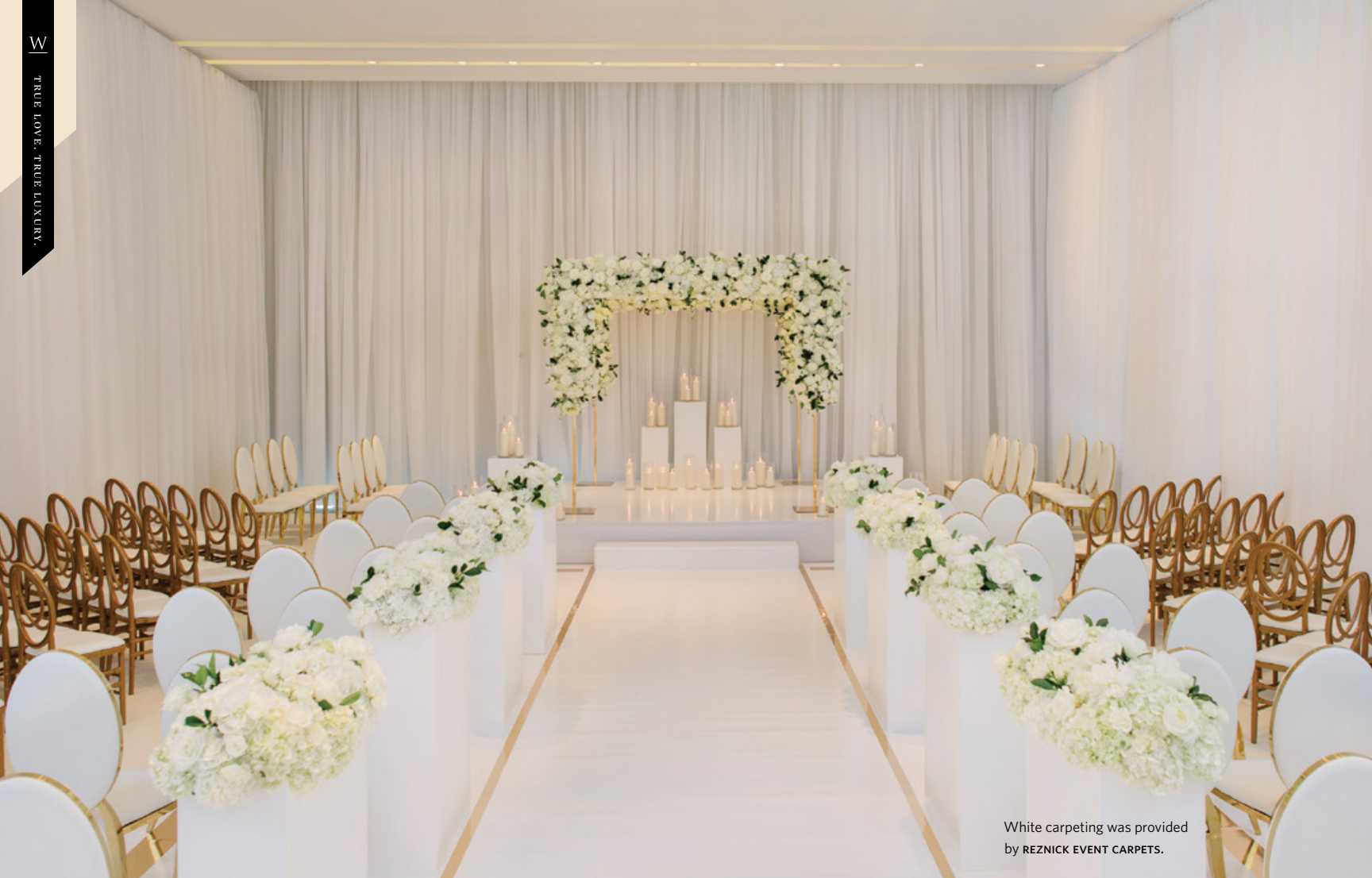
White carpeting was provided by REZNICK EVENT CARPETS.