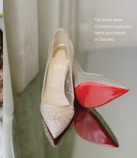
The bride wore Christian Louboutin heels purchased in Toronto.