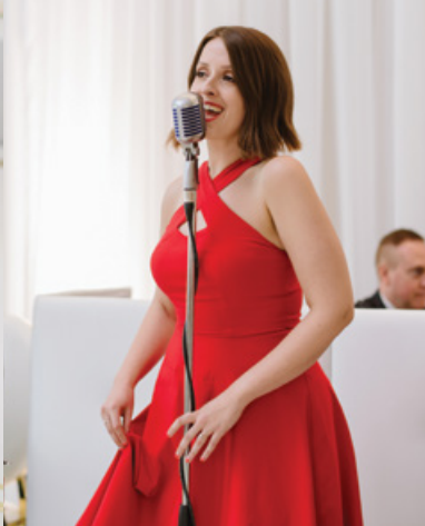
Jazz band LADY BE GOOD performed throughout the ceremony, cocktail hour, and dinner.