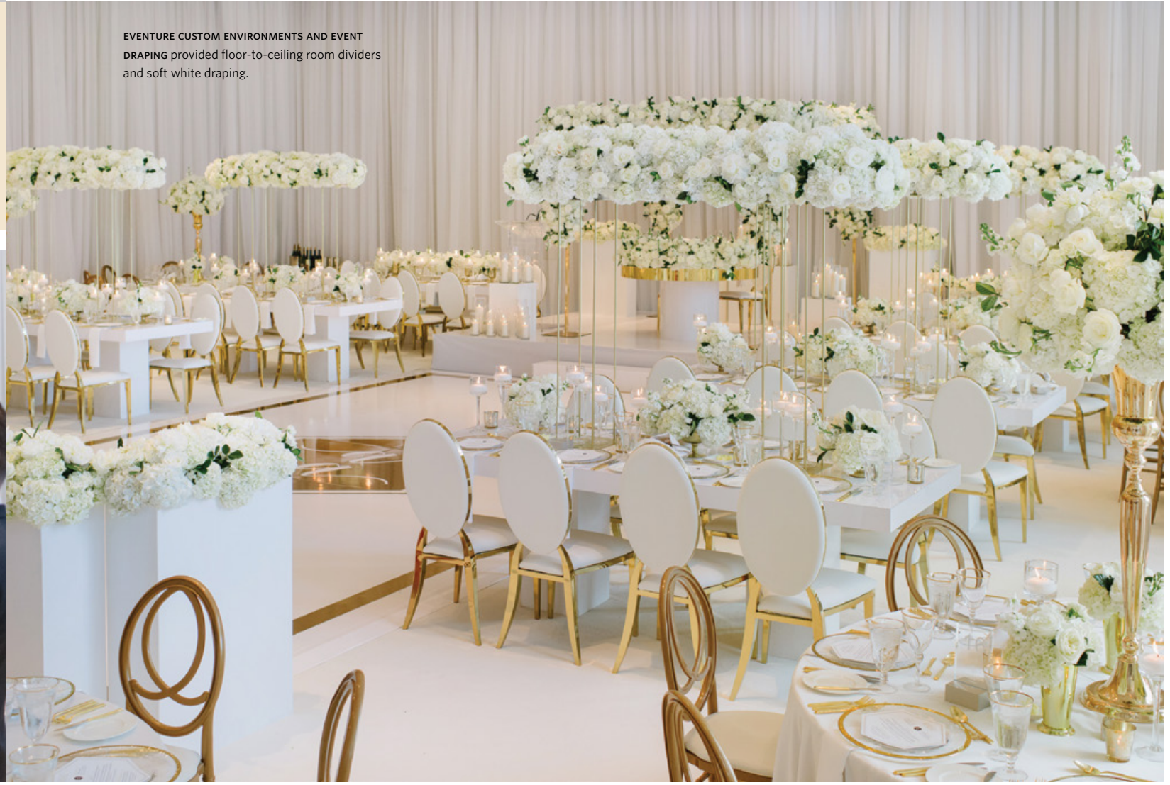
EVENTURE CUSTOM ENVIRONMENTS AND EVENT DRAPING provided floor-to-ceiling room dividers and soft white draping.