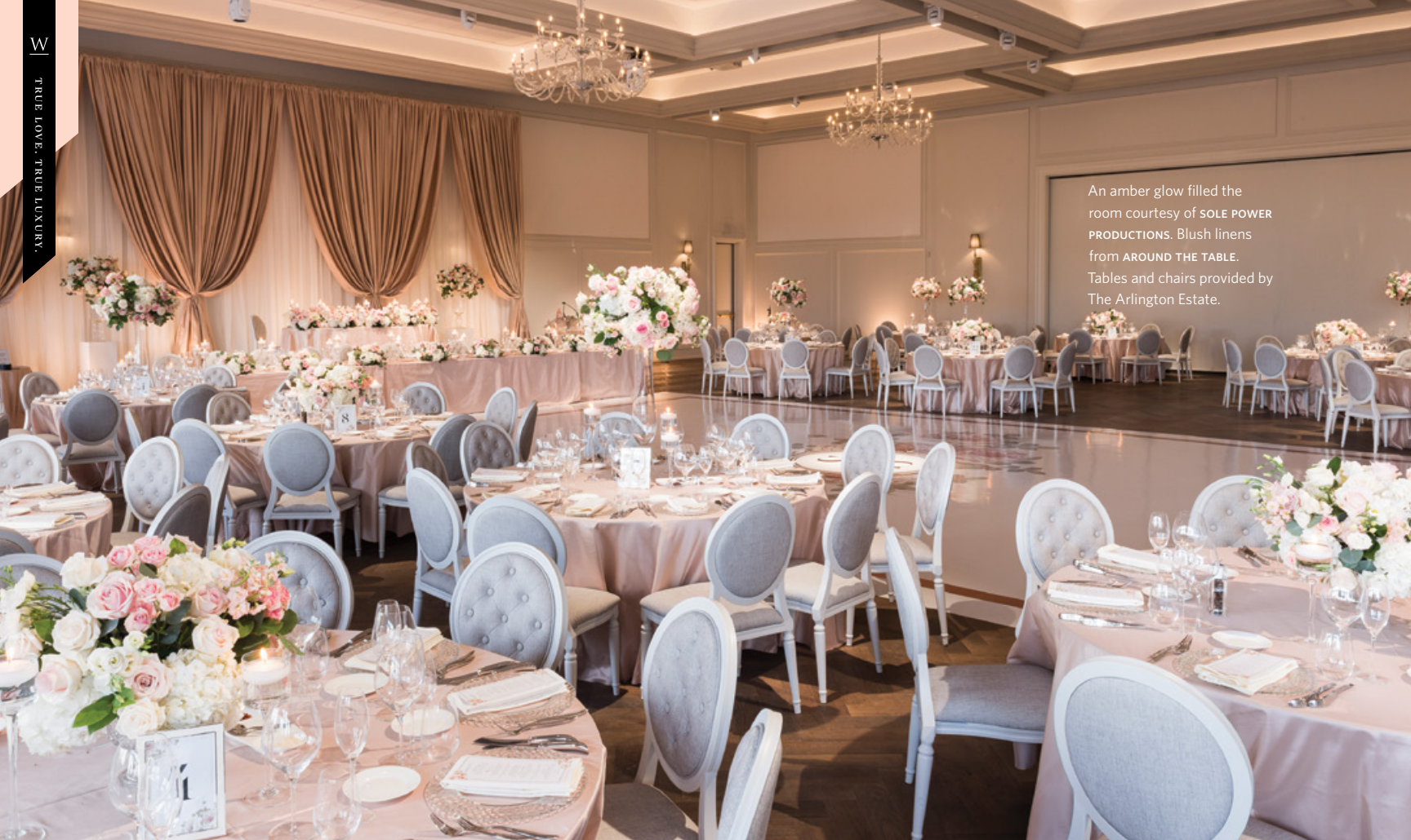
An amber glow filled the room courtesy of SOLE POWER PRODUCTIONS. Blush linens from AROUND THE TABLE. Tables and chairs provided by The Arlington Estate.