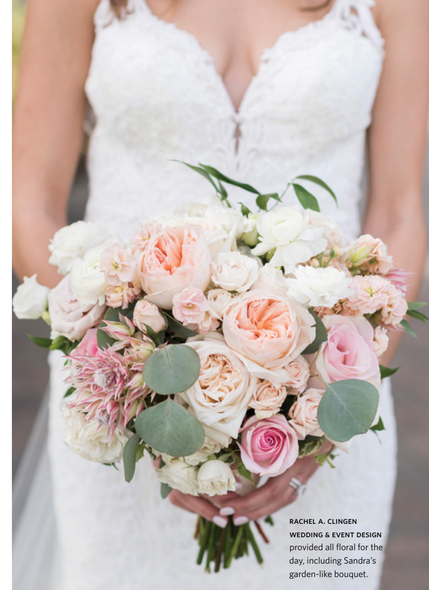
RACHEL A. CLINGEN WEDDING & EVENT DESIGN provided all floral for the day, including Sandra's garden-like bouquet.