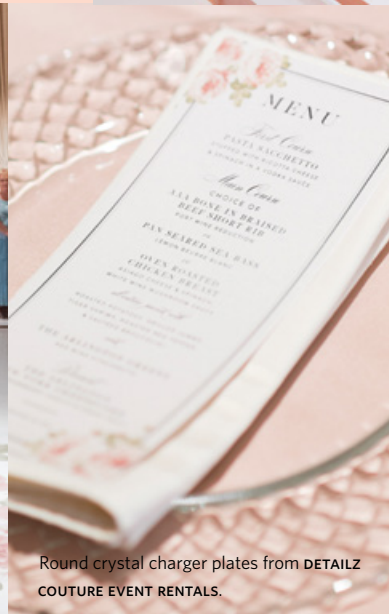
Round crystal charger plates from DETAILZ COUTURE EVENT RENTALS.