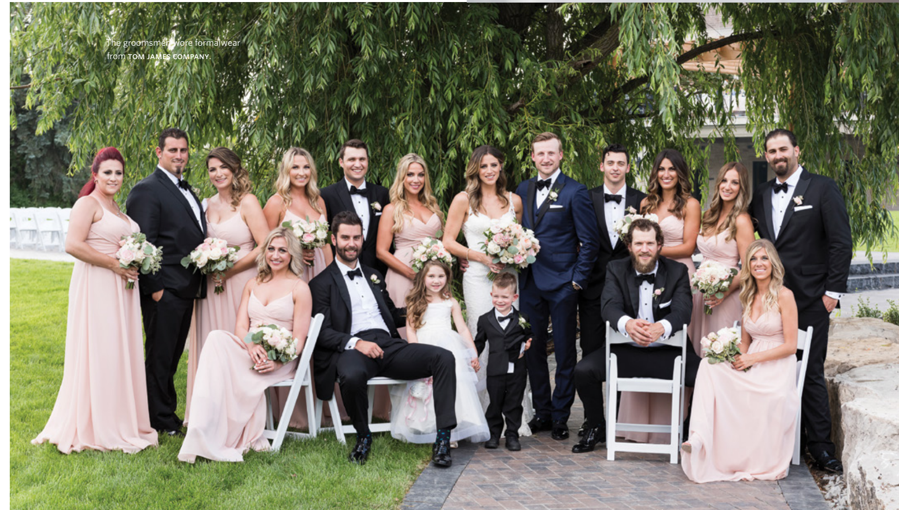
The groomsmen wore formalwear from TOM JAMES COMPANY.