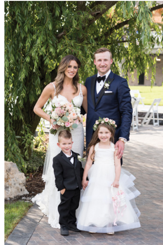
The couple's nephew and goddaughter served as ring bearer and flower girl.