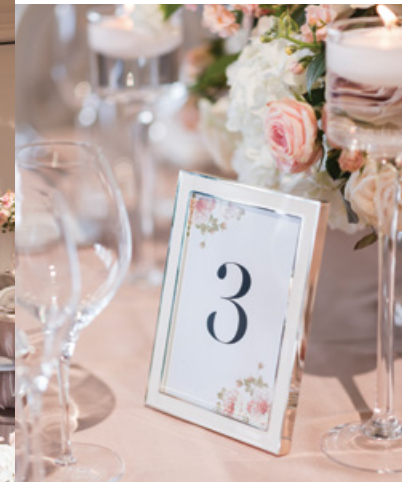
PAPER & POSTE designed bar signage, menus, table numbers, escort cards, monogrammed napkins, seating chart, cigar wraps, and match boxes for the reception. They also designed the dance floor that was produced and installed by Dance Floor Décor, featuring a rose gold foil border, the couple's personalized monogram, and the same pink floral motif found on the invitation suite and day-of stationery.