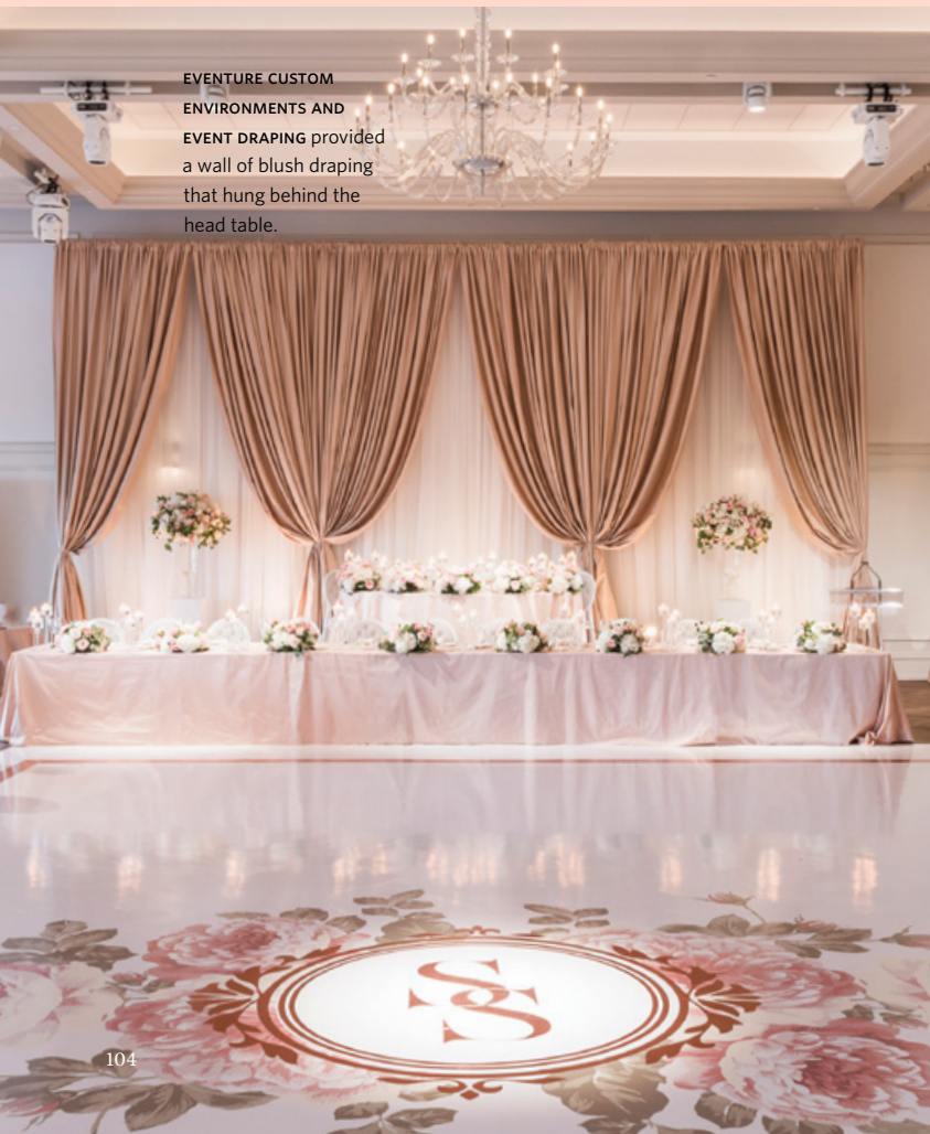
EVENTURE CUSTOM ENVIRONMENTS AND EVENT DRAPING provided a wall of blush draping that hung behind the head table.

A floral runner cascaded down the sweetheart table while low groupings of blush florals and flickering candles stood on the longer gallery table in front, where the wedding party was seated.