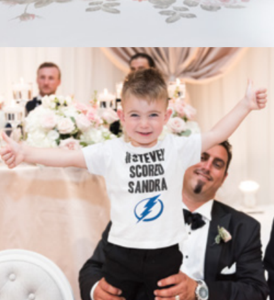
Sole Power Productions also provided the cigar roller, fireworks, photo booth, and other musical acts heard throughout the day.